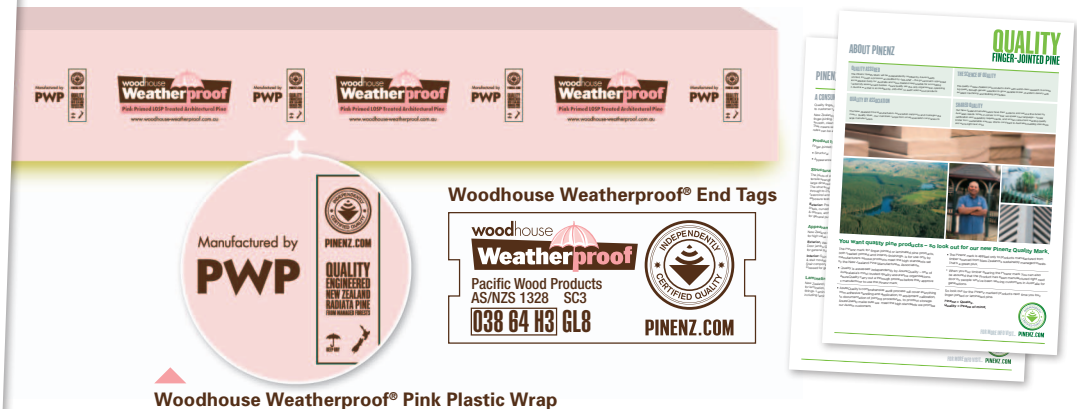
Woodhouse Weatherproof® Pink Plastic Wrap

Proof in design... Proof in construction... Proof over time... All the Proof you need... Woodhouse Weatherproof®